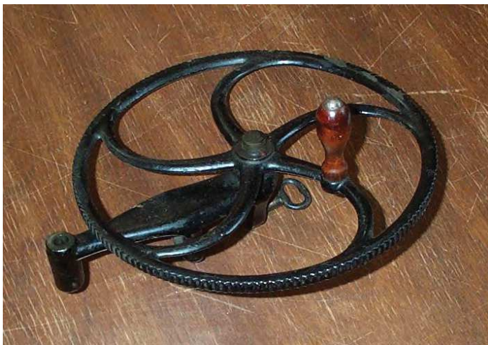
Bickford Bobbin Winder . The wheel contacted a rubber roller, not shown.

The Crank Wheel reduction was similar to the Gearhart machines. Three turns of the crank turned the Cam Ring two turns.