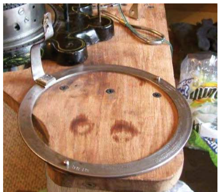
Figure 4. The carrier is shown here mounted on the Sliding Ring . Note two short pegs on the Sliding Ring . They limit how far the carrier will move when changing direction of rotation.