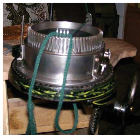
Figure 8. A short length of I-cord was knitted on four needles.