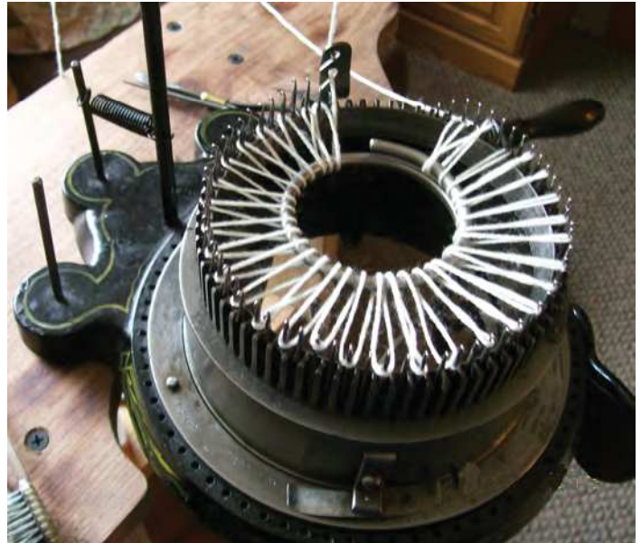
Figure 9. Setting up the Bickford for tubing.