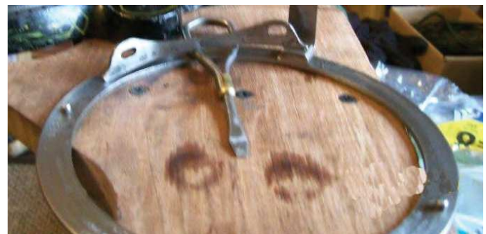
Figure 3. Here the Automatic Lever is shown resting on the Sliding pad with the right end elevated by the carrier pad.

Figure 7 is all about the space between the needles and carrier. The latches are 1/4 inch long, and if the