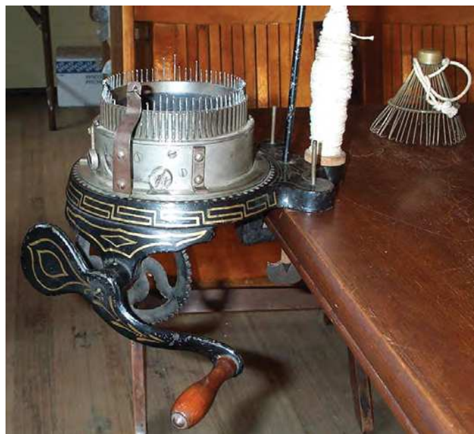
A nice view of the handle side of the machine.

The serial number on the Sliding Ring is 9613. The latest patent date stamped on the ring is July, 1869, and the earliest, Sept 10, 1867. The cam controls are improved over the Brattleboro machine. It had to be manufactured after July, 1869, or it would not