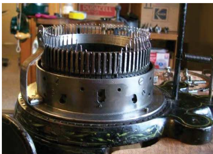
Figure 6. This shows the Revolving Cam Ring striped of all screws and external parts. The Yarn-Carrier and Sliding Ring assembly can be lifted off the machine in this configuration, without removing the needles or Revolving Cam Ring .

https://archive.org/stream/illustratedinstr00bic#page/n9/mode/2up