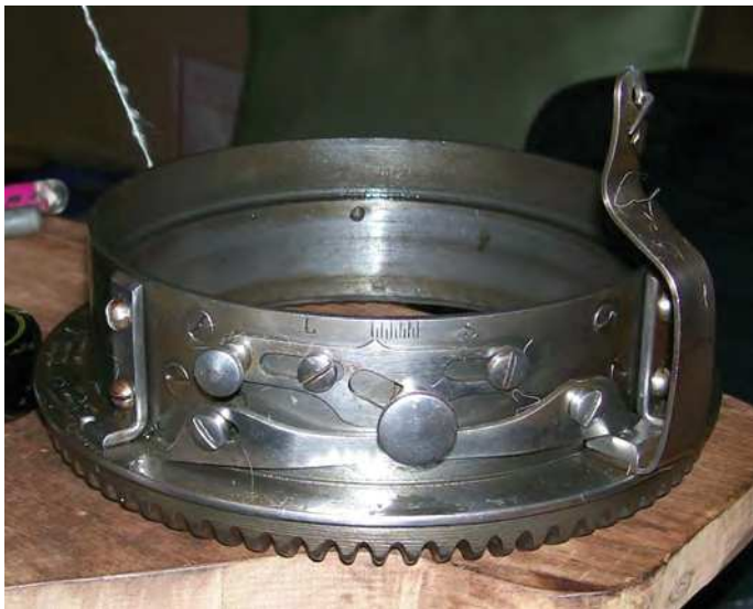
Figure 11. View of cam controls. These controls adjust stitch length and reverse the cams. The Automatic Lever was also shown in Figure 3. The right end is resting on the carrier pad.

Figure 10 shows the unique design of the cams. Any modifications to the cams would spoil the originality of the machine.