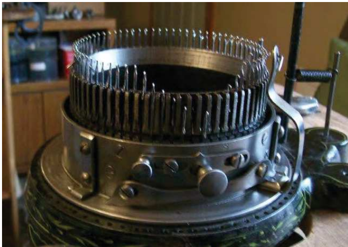
Figure 1. Carrier on the right. Right end of Automatic Lever is up.