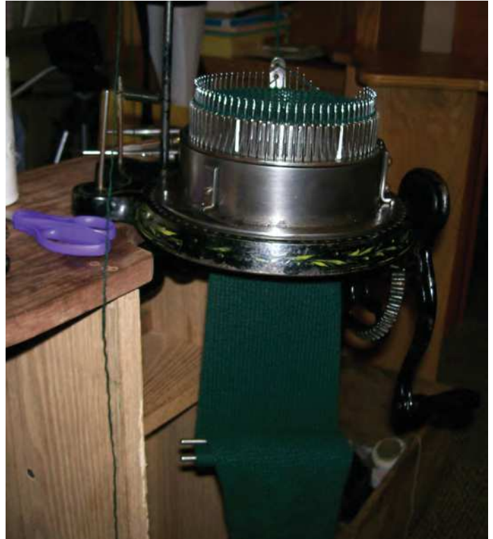
Figure 12. Sixty inches of yarn tubing was done with no dropped stitches.

I will end up with a very nice dark green scarf.