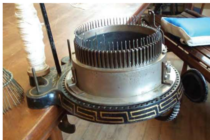
View of left side. Note a series of holes around the base. These hole were for pins that served to stop the carrier and shift the cams into reverse when turning a heel or knitting flat web.

have those dates shown. Bold type in the text applies to the names given to machine parts by the Bickford Company.