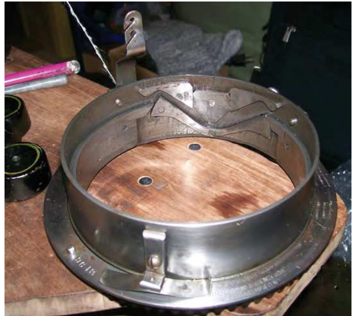
Figure 10. Inside view of cam ring. The serial number on the Sliding Ring is 9613.

An interesting feature of the Bickford machine is the method of shifting from forward to reverse when turning heels. A pin is inserted in one of the many holes at the base of the machine, The pin stops rotation of the carrier, but allows the cam ring to rotate farther, thus repositioning the cams and carrier to reverse direction.