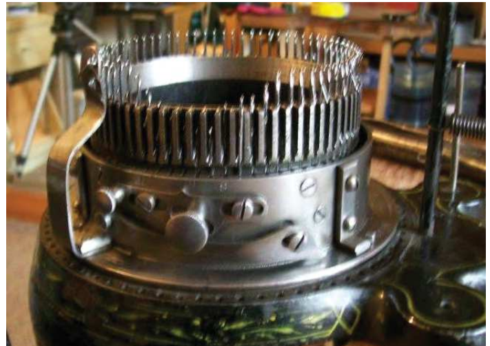
Figure 2. Carrier on the left. Left end of Automatic Lever is up.

Figures 1 and 2 show the carrier on the right, then on the left. As the Yarn-Carrier and Slip Ring are rotated back and forth, the “ Automatic Lever ” rocks like a rocking chair. One end goes down to the Slip Ring , and the other end rises to rest on the carrier pad. The Automatic Lever is shown again in Figure 3 for better understanding. This movement is required so as to place the carrier on the correct side of the needles in operation. The Automatic Lever is connected to a cam inside the Revolving Cam Ring . That inside cam determines when needles rise before going under the Stitch cam , not shown. Figure 4 shows the Yarn-Carrier and Sliding Ring assembly.