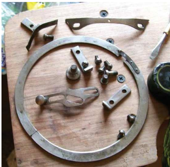
Figure 5. The large ring here is the Ring Clasp . It holds needles in the Needle Cylinder , and also holds the Revolving Cam Ring down against the Bedplate .

carrier is closer than 1/4 inch, they can be broken by the carrier. Other machines require this spacing to be close. The Bickford machine has a built in delayed timing of the carrier that compensates for this wide spacing. When set up as in these images, my Bickford machine knitted tubes with no dropped stitches.